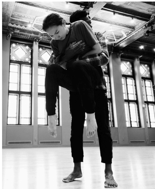
Selection of MeenMoves Photos

Fragments of Roy's compelling speech are combined into an original composition for viola, double bass, clarinet, two oboes, and electroacoustic accompaniment, performed live as the soundscore for an evening-length dance-theater performance with six dancers. As the choreography follows the score and the score follows the choreography, a deeply woven artistic rumination on the divisions, power struggles, and avoided conversations all around us gives way to hope that fleeting moments of unity and solidarity can be made permanent if we just answer one question: What does it take for all of us to feel as though we belong?